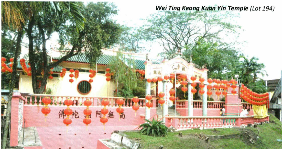
Wei Ting Keong Kuan Yin Temple (Lot 194)

The Selangor and Kuala Lumpur Hokkien Association is the owner of the hundred-year-old Wei Ting Keong Kuan Yin Temple (Lot 194) located right next to the proposed project. This historic Temple is an important place of worship for the Buddhist and the Taoists communities; it is also listed as a tourist site which attracts many foreign visitors.